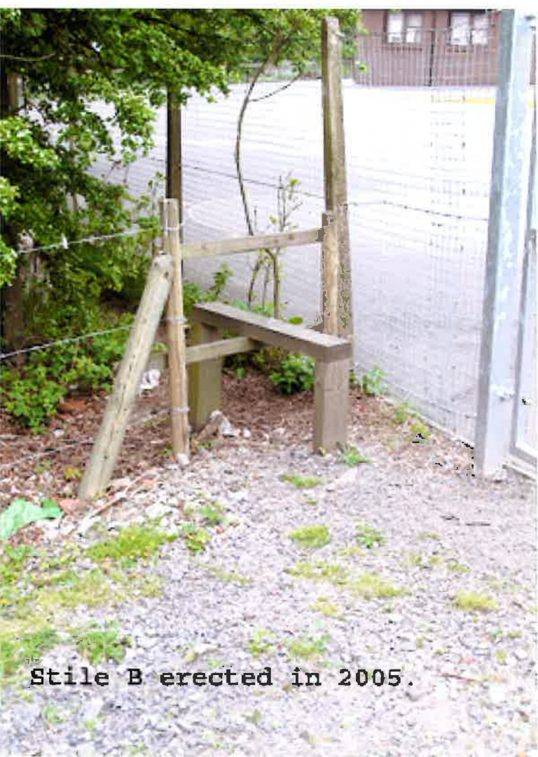
Stile B erected in 2005.