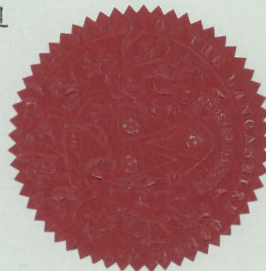
Assistant Clerk of the County Council

THE COMMON SEAL of the Lancashire County Council was hereunto affixed in pursuance of Resolutions passed at meetings of the Highways and Transportation Committee duly convened and held on the 1st June, 1994 and 2nd November, 1994.