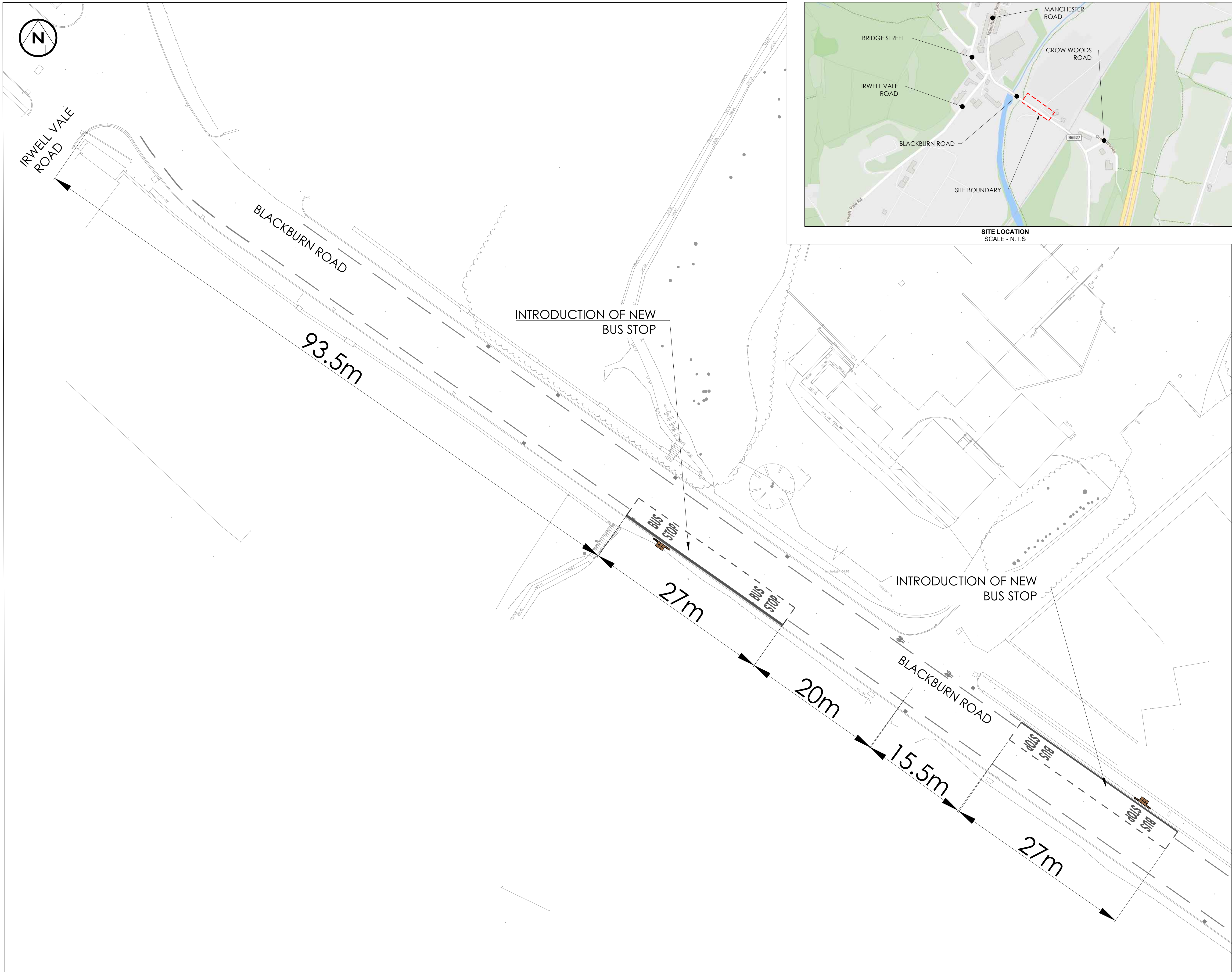
NEW BUS STOP LOCATION PLAN SCALE - 1:250