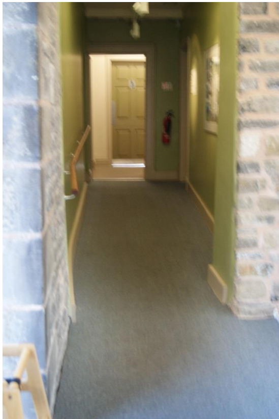
Photos of the accessible toilet door (right) and corridor leading up to it