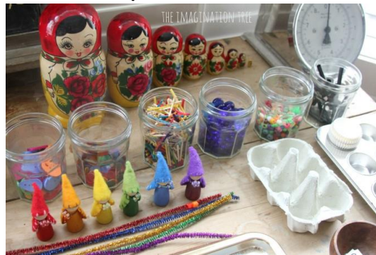
Counting (Counting collections)