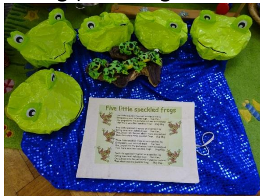
Using number rhymes and counting songs