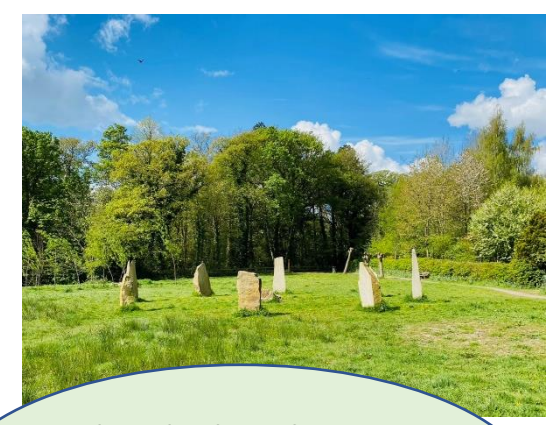
Take a look at the stone circle. Can you describe what you see and feel?