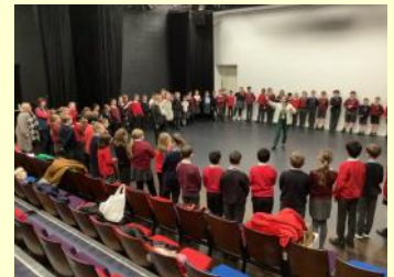
Pupils from Bretherton, English Martyrs and Barnoldswick schools enjoy activities at Burnley Youth Theatre

The project costs £100 and includes CPD for participating teachers—a full day in November and a morning in February—enabling them to get to know each other and plan their link, but also to learn about the project and the suggested programme and resources it has to offer, used successfully up and down the country under the overall guidance of The Linking Network .