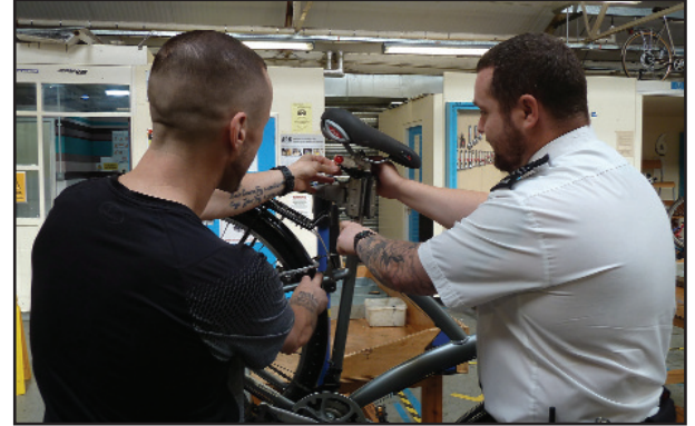
The custodial manager with a veteran in the bike workshop, which is run by a veteran at HMP Risley.

Ex-Forces personnel, who find themselves in the prison system in Lancashire, now have specific measures to support them including a dedicated prison wing – The Discovery Wing at HMP Risley.