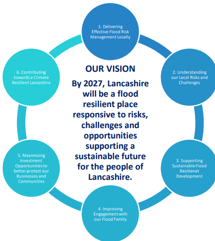
Figure 2: Our Vision and Themes for Delivery

You can read more about the work we will be doing under these themes from Page 87 of our Strategy.