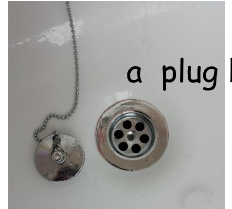
a plug hole