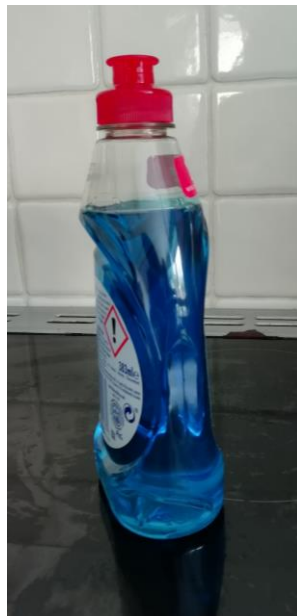
washing up liquid