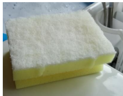
a washing up sponge