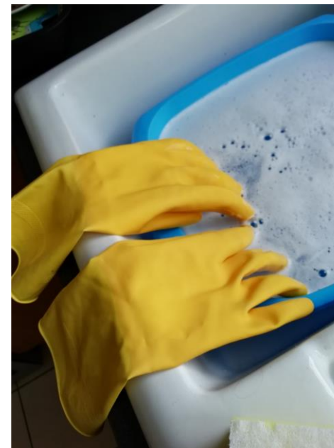
washing up gloves