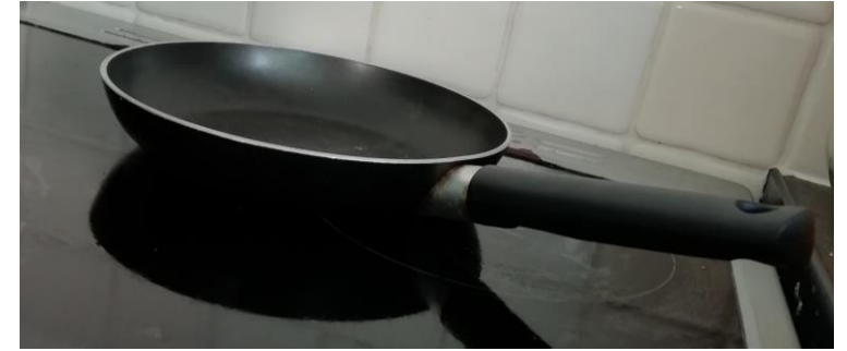
a frying pan