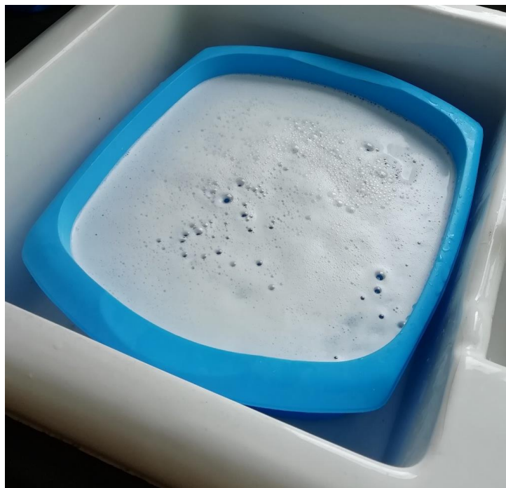
a washing up bowl