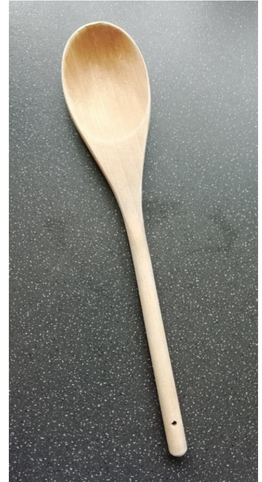
a wooden spoon