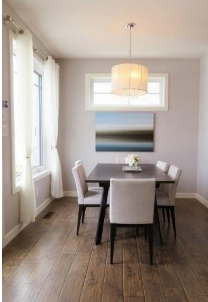
table chair light curtains