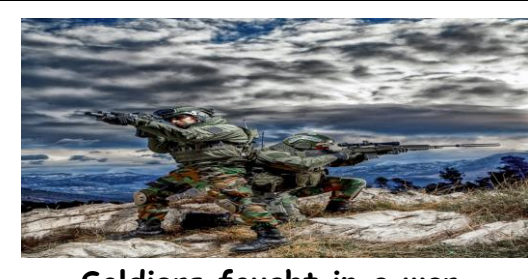
Soldiers fought in a war.