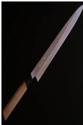
a knife for cutting