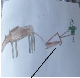
a plough for farming