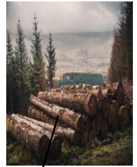
wood for cooking and building