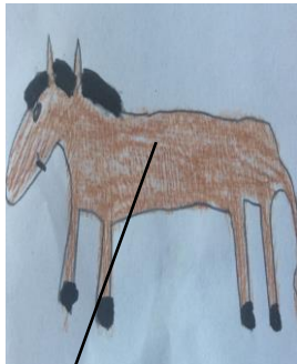
horses for riding