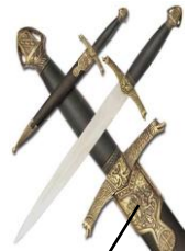
a sword for fighting