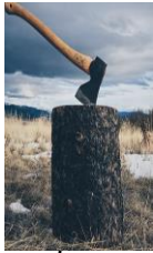
an axe for cutting