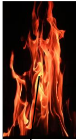
a fire for cooking and heating