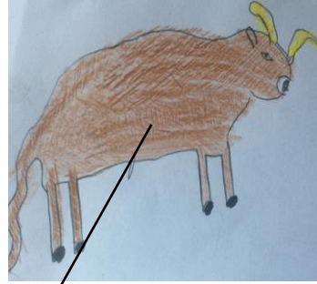
oxen for eating and farming