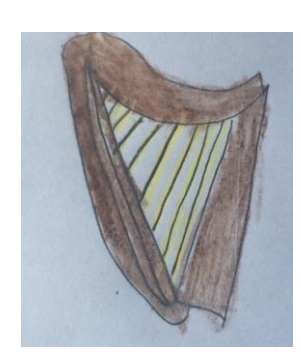
a <u>harp</u> to play music