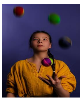
<u>balls</u> to juggle