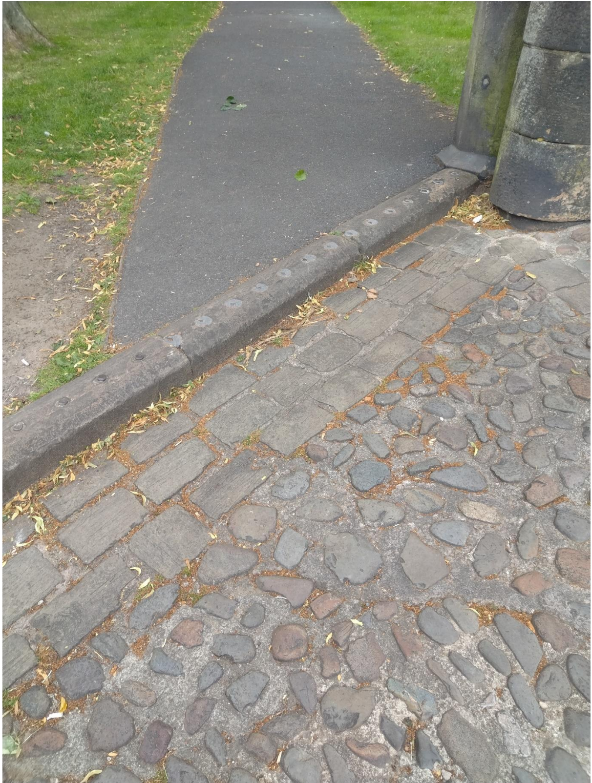
Photo 12: Step from Perimeter Path (outside the castle site) nr. Main Gate