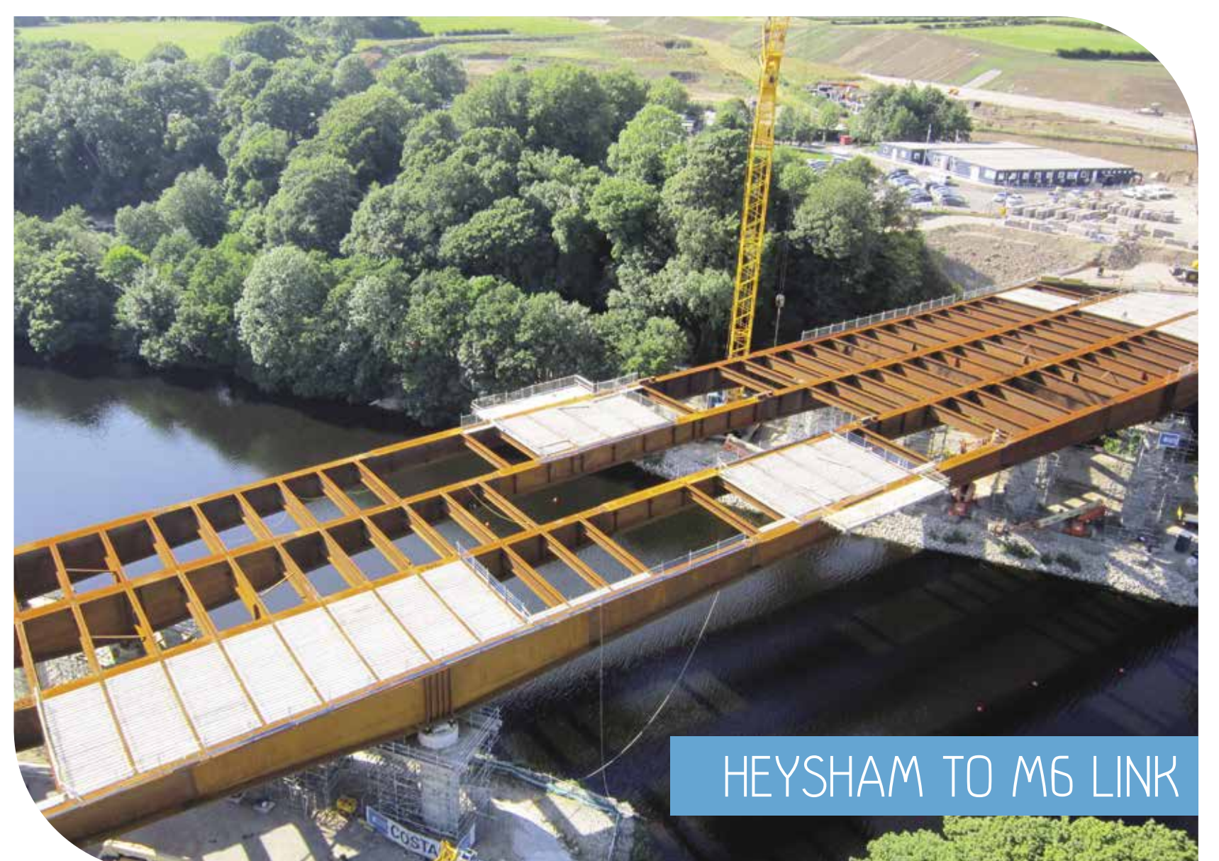
HEYSHAM TO M6 LINK