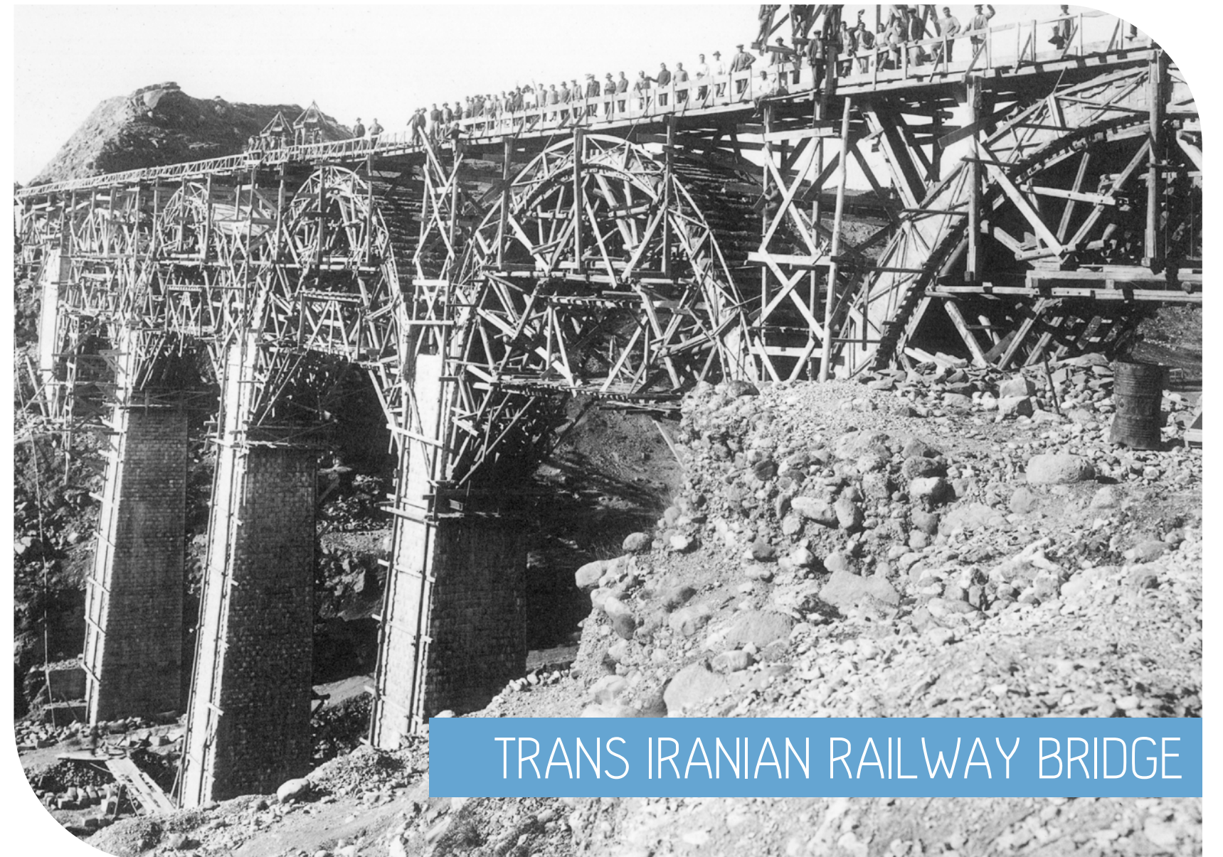
TRANS IRANIAN RAILWAY BRIDGE