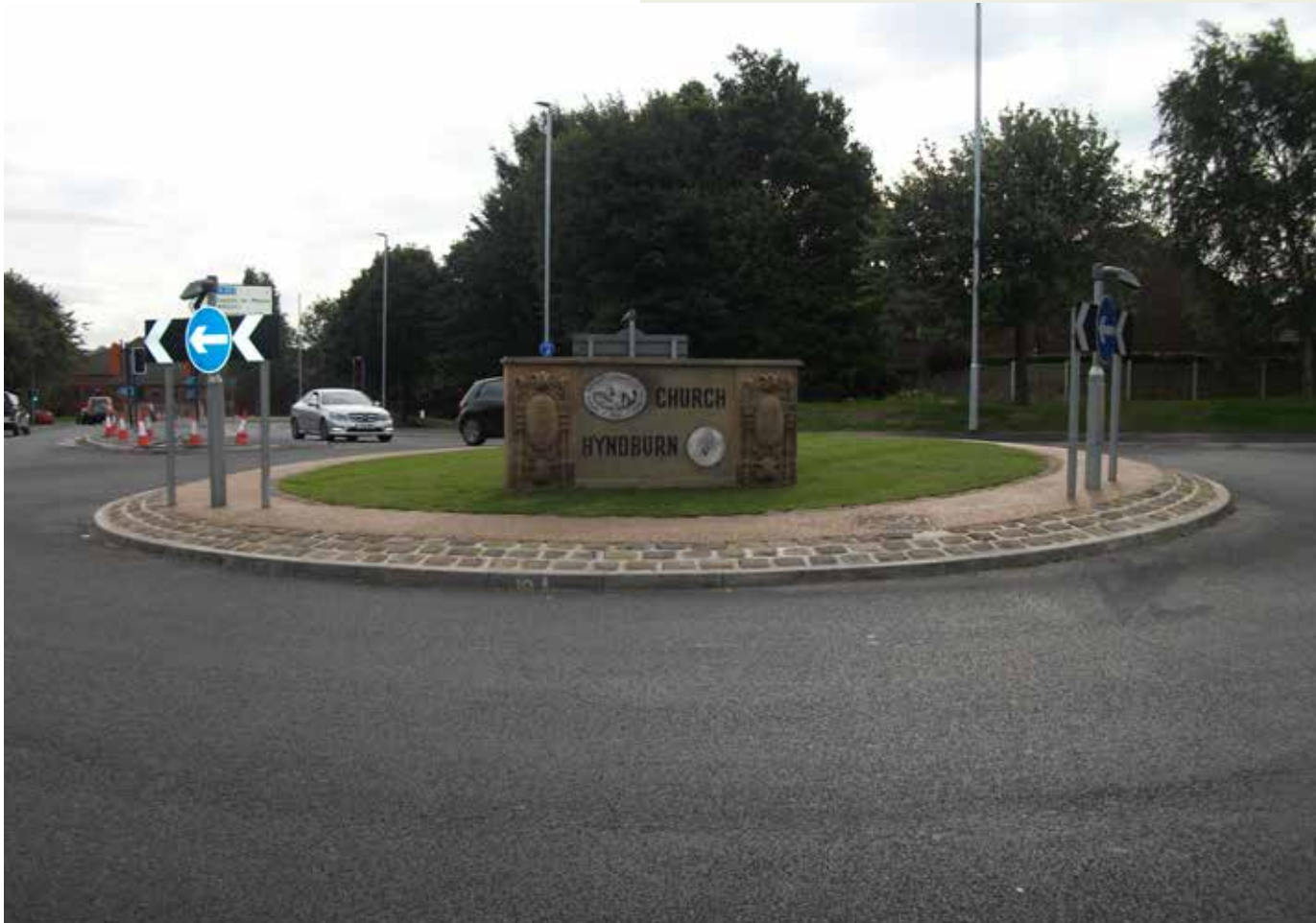
Church Gateway, July 2015