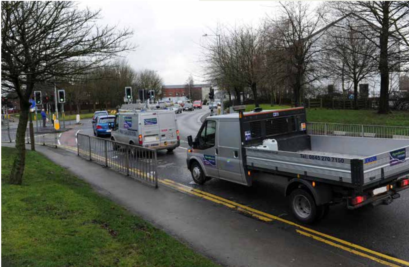
Church Gateway before work started