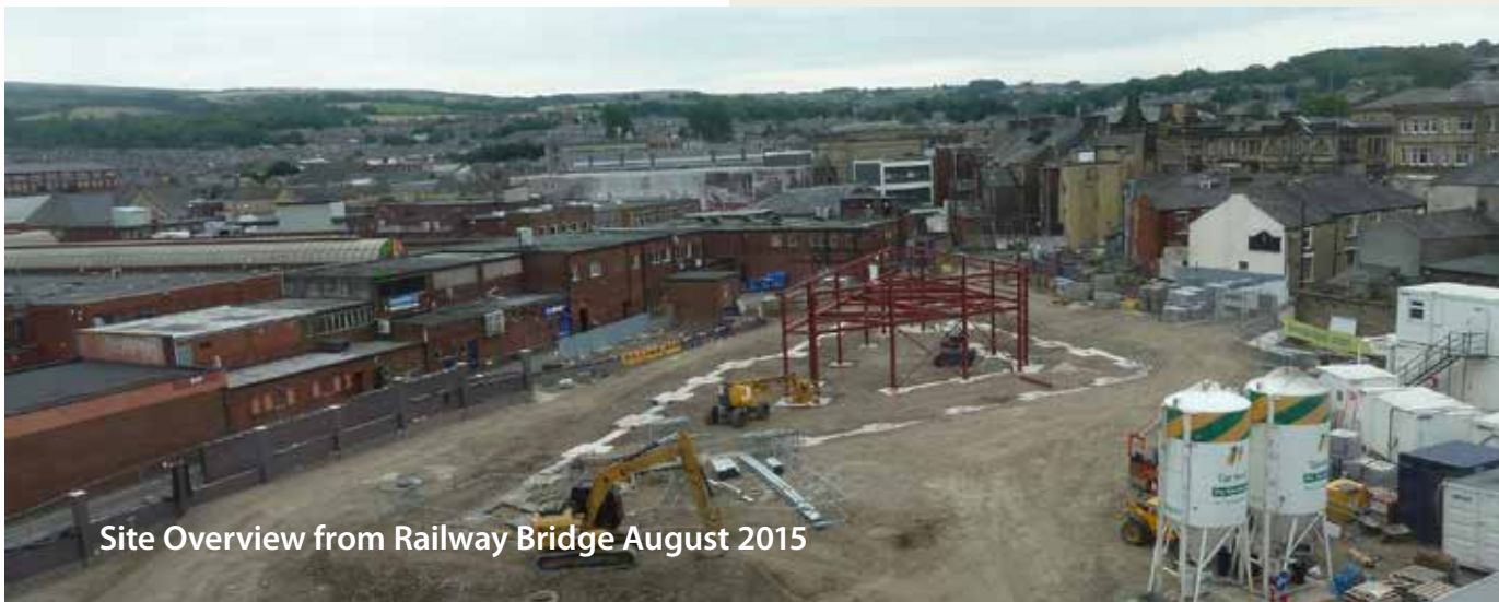
Site Overview from Railway Bridge August 2015

More photos are available on the Lancashire County Council Flickr page, www.flickr.com/photos/lancashirecc/ which has an album dedicated to the Accrington Bus Station.