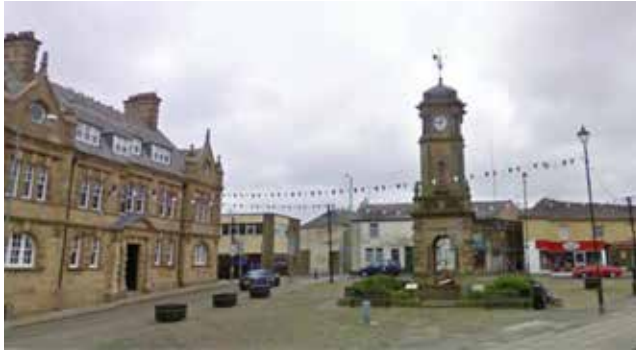
Towngate before and after the completion of the Phase 1 Public Realm Improvement works.